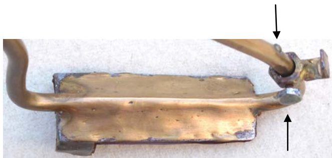
Adjustable hook, set screw, and slider stop